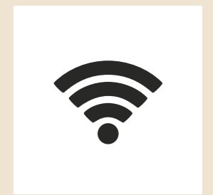
WiFi and Bluetooth enabled on-screen information and entertainment.