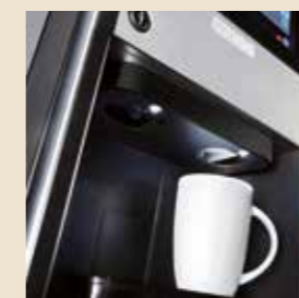
A light path in the cup area helps ensure that the cup is placed in the correct position. Cup sensors recognize cups or mugs made from a variety of different material including paper, plastic, glass and porcelain.