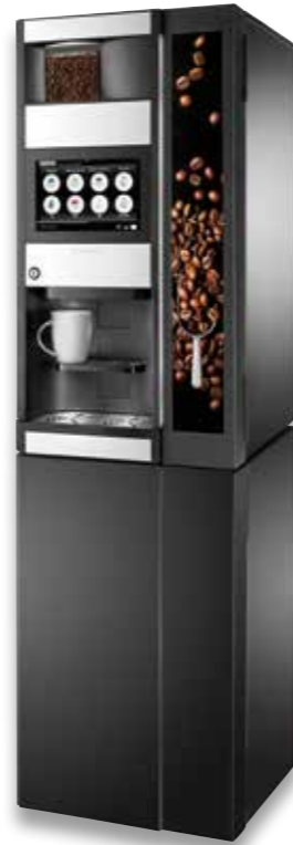
The elegant base stand enhances the design of the machine.

Evoca S.p.A. reserves the right to alter specifications without prior notice. L026X1