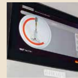
The user-friendly interface lets you prepare a drink just the way you like it, allowing you to make changes to the strength and amount of ingredients - you can even save your personalized drink in the layout.