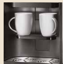
Separate delivery points: Coffee, chocolate, and mixed drinks on the left, and water on the right. This prevents any cross contamination into the water.