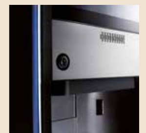
LED lights frame the cup area which enhance the overall visual appearance and user experience.