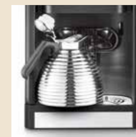
The spacious delivery area with adjustable cup holders allows you to fill coffee pots or thermo jugs.