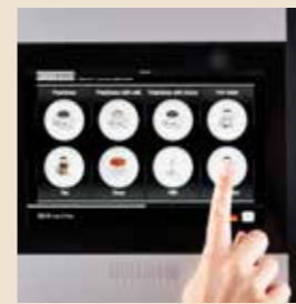
The 10" touch screen - 1280 x 800 - offers a visual guide, making choices easy. The design and layout of the screen can also be fully customized to suit any environment.